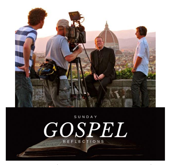
Sunday, April 14, 2024 | Third Sunday of Easter | Luke 24:35-48

Click on the image below to browse all titles and watch on-demand