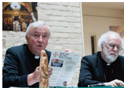
The Press Conference following the Conference at Lambeth