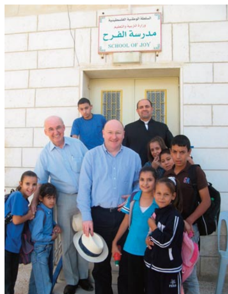
Some of the children at the School of Joy