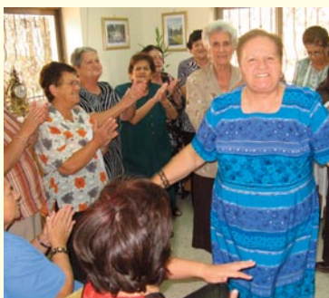
A sing-along at St Martha's House