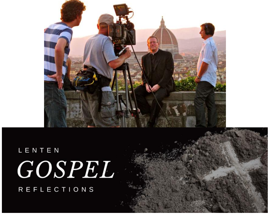
Sunday, April 13, 2025 Palm Sunday of the Passion of our Lord | <u>Luke 22:14—23:56 (or 23:1-49)</u>

Click on the image below to browse all titles and watch on-demand